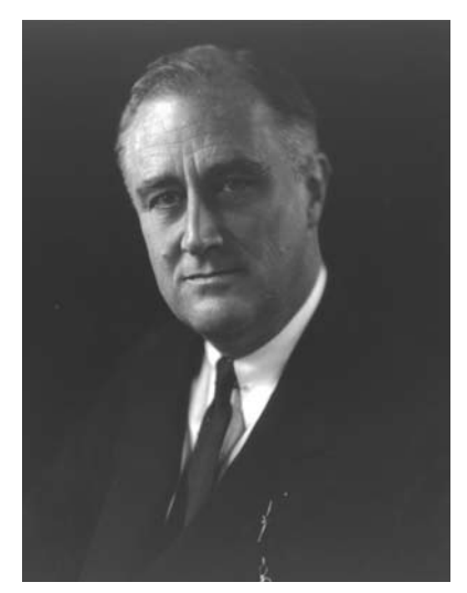
AMERICANS VOTED for Franklin Roosevelt in 1932 expecting him to adhere to the Democratic Party platform, which called for less government spending and regulation.

then passed and Hoover signed the Revenue Act of 1932. The largest tax increase in peacetime history, it doubled the income tax. The top bracket actually more than doubled, soaring from 24 percent to 63 percent. Exemptions were lowered; the earned income credit was abolished; corporate and estate taxes were raised; new gift, gasoline, and auto taxes were imposed; and postal rates were sharply hiked.