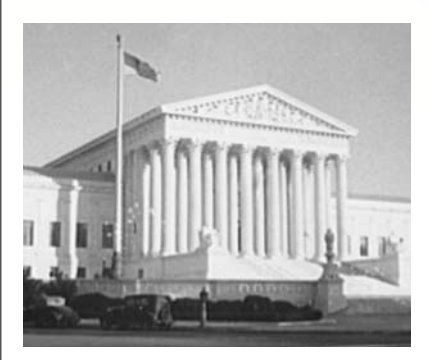
THE SUPREME COURT came under attack by President Roosevelt because it declared important parts of the "New Deal" unconstitutional. FDR's "court-packing" scheme contributed to the resumption of economic depression in 1937.

tive order to tax all income over $25,000 at the astonishing rate of 100 percent. He also promoted the lowering of the personal exemption to only $600, a tactic that pushed most American families into paying at least some income tax for the first time. Shortly thereafter, Congress rescinded the executive order,