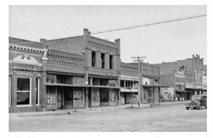
THE GREAT DEPRESSION devastated every part of America, even its smallest towns .

According to this simplistic perspective, an important pillar of capitalism, the stock market, crashed and dragged America into depression. President Herbert Hoover, an advocate of "hands-off," or laissezfaire, economic policy, refused to use the power of government and conditions worsened as a result. It was up to Hoover's successor, Franklin Delano Roosevelt, to ride in on the white horse of government intervention and steer the nation toward recovery. The apparent lesson to be drawn is that capitalism cannot be trusted; government needs to take an active role in the economy to save us from inevitable decline.