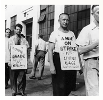
SPECIAL POWERS GRANTED to organized labor with the passage of the Wagner Act contributed to a wave of militant strikes and a "depression within a depression" in 1937.

The genesis of the Great Depression lay in the irresponsible monetary and fiscal policies of the U.S.