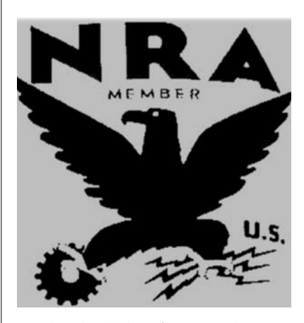
TO MANY AMERICANS, the National Recovery Administration's bureaucracy and mind-numbing regulations became known as the "National Run Around."

states had ratified it so that the 21st Amendment became part of the Constitution. One observer, commenting on this remarkable turn of events, noted that of two men walking down the street at the start of 1933 — one with a gold coin in his pocket and the other with a bottle of whiskey in his coat — the man with the coin would be an upstanding citizen and the man with the whiskey would be the outlaw. A year later, precisely the reverse was true.