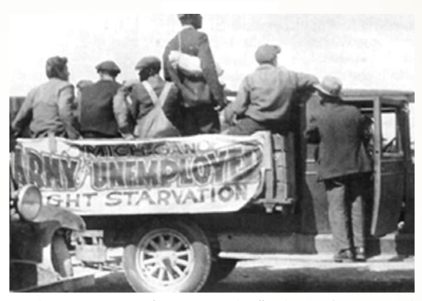
UNEMPLOYMENT SKYROCKETED after Congress raised tariffs and taxes in the early 1930s and stayed high as policies of the Roosevelt administration discouraged investment and recovery during the rest of the decade.

At first, only the "smart" money — the Bernard Baruchs and the Joseph Kennedys who watched things like money supply and other government policies — saw that the party was coming to an end. Baruch actually began sell-